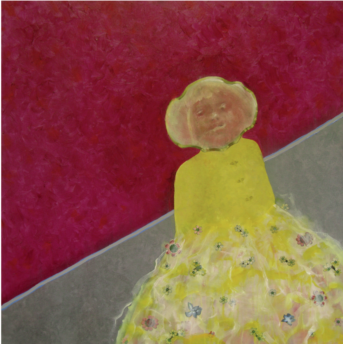
Dreaming Girl 1 , 2017, oil on canvas, 90 cm x 90.5 cm