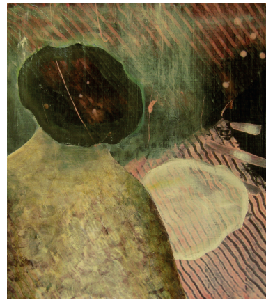
Whilst Olympia Sleeps , 2017, oil on canvas, 53 cm x 48 cm

In Orpheus (1950) Jean Cocteau presents an hypnotic example of the mirror’s filmic potential. In this retelling of the Greek Myth, Orpheus is a poet who puts on a pair of magical gloves, which enable him to pass through a mirror into the underworld in search of his dead wife. We follow on through the camera lens. This unforgettable scene bridges our reality and a metaphysical world beyond the mirror. Cocteau’s guardian of this underworld tells us of the inevitable loss that accompanies this transition, ‘Two worlds struggle to coexist, the world of life and the world of death’.