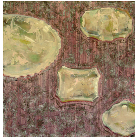
Family , 2017, oil on canvas, 79 cm x 78 cm

disappointment of self-reflection; in short, psychological other .