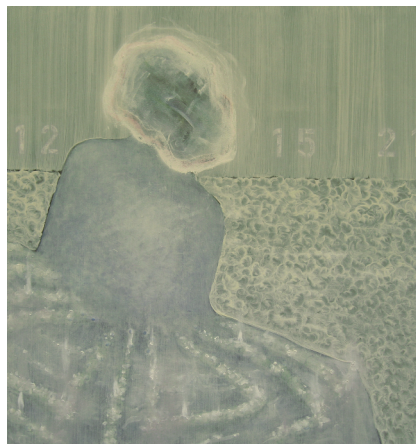
Dreaming Girl 3 (Infanta) , 2017, oil on canvas, 79.4 cm x 76.1 cm

to a puzzle, he accepts that some paintings are a starting point for speculation with no possibility of completion. Paintings of this kind may require a different approach to looking at them, one that accepts that they cannot be read or understood in a logical framework and our