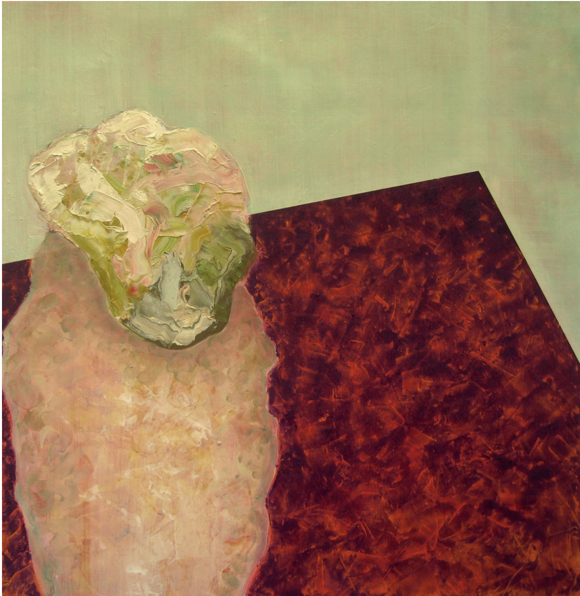
Mirror Head 2 , 2017, oil on canvas, 78.5 cm x 76.5 cm