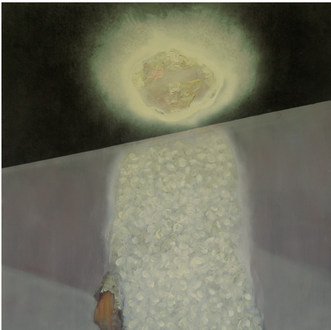
Dreaming Girl 7 , oil on canvas, 92 cm x 91.5 cm