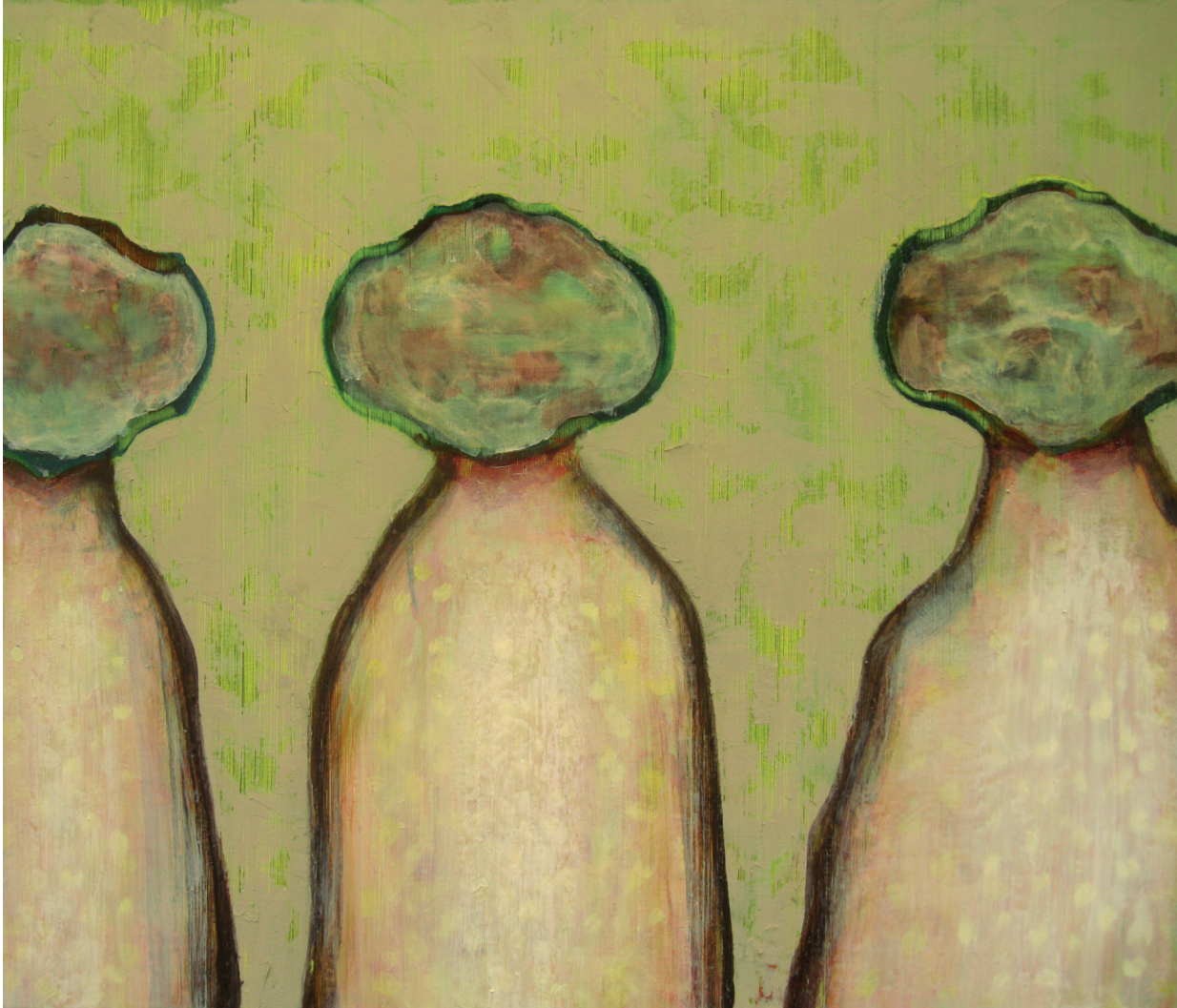
The Circle , 2017, oil on canvas, 66.6 cm x 76.5 cm