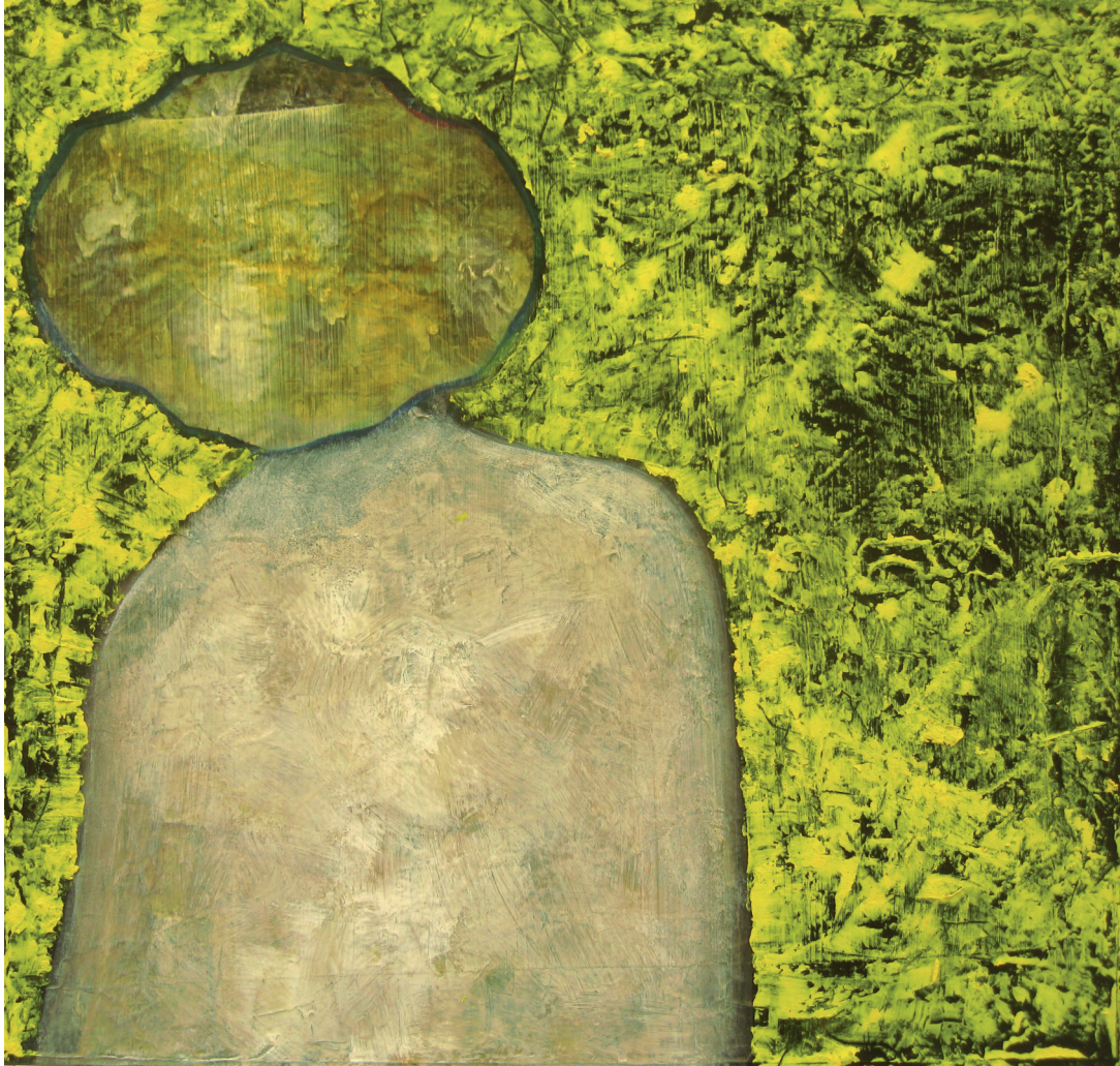
Dreaming Girl 6 , 2017, oil on canvas, 49.6 cm x 52.2 cm