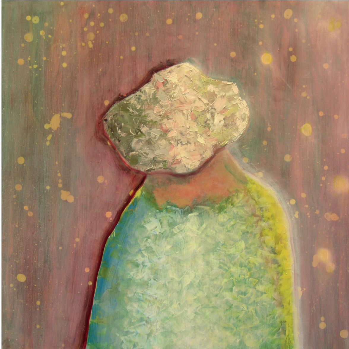
Dreaming Girl 5 , 2017, oil on canvas, 78 cm x 77.5