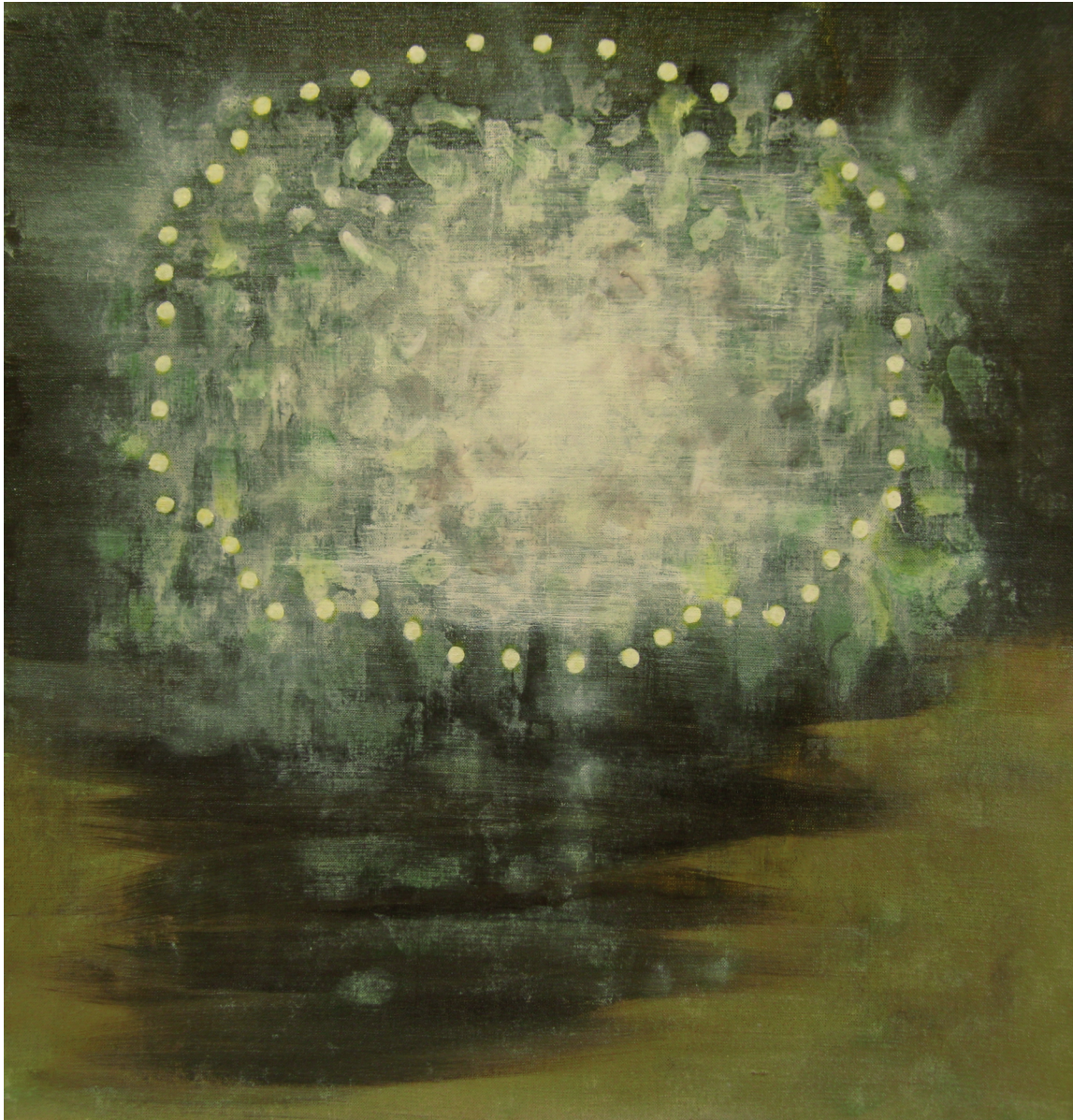
Secret Life of Mirrors , 2017, oil on canvas, 52.8 cm x 50.1 cm